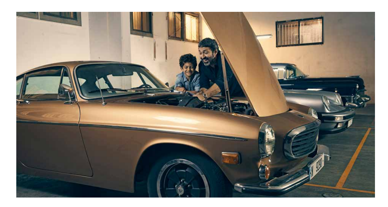
ILLUSTRATION OF THE CASE STUDY

As well as acting as the trustees, the Emirates NBD trust company in Jersey administers the whole structure and liaises with property managers for real estate and coordinates the crewing requirements for the yacht.