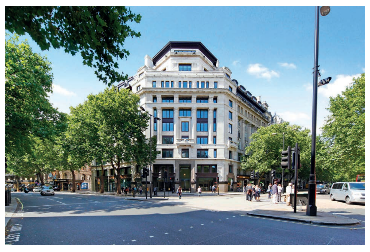
QUILTER CHEVIOT CORPORATE HEADQUARTERS